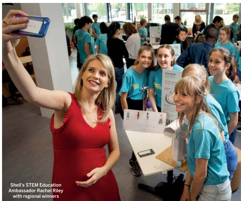
Shell's STEM Education Ambassador Rachel Riley with regional winners

There's £45,000 worth of exciting STEM prizes on offer, including up to £5,000 to boost your school's STEM offering, with winners from every region of England, Scotland and Wales taking home a piece of the prize money. Moreover, also up for grabs is a funded, once-in-a-lifetime VIP STEM experience, which